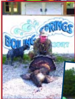
See us for great turkey and deer hunts too...